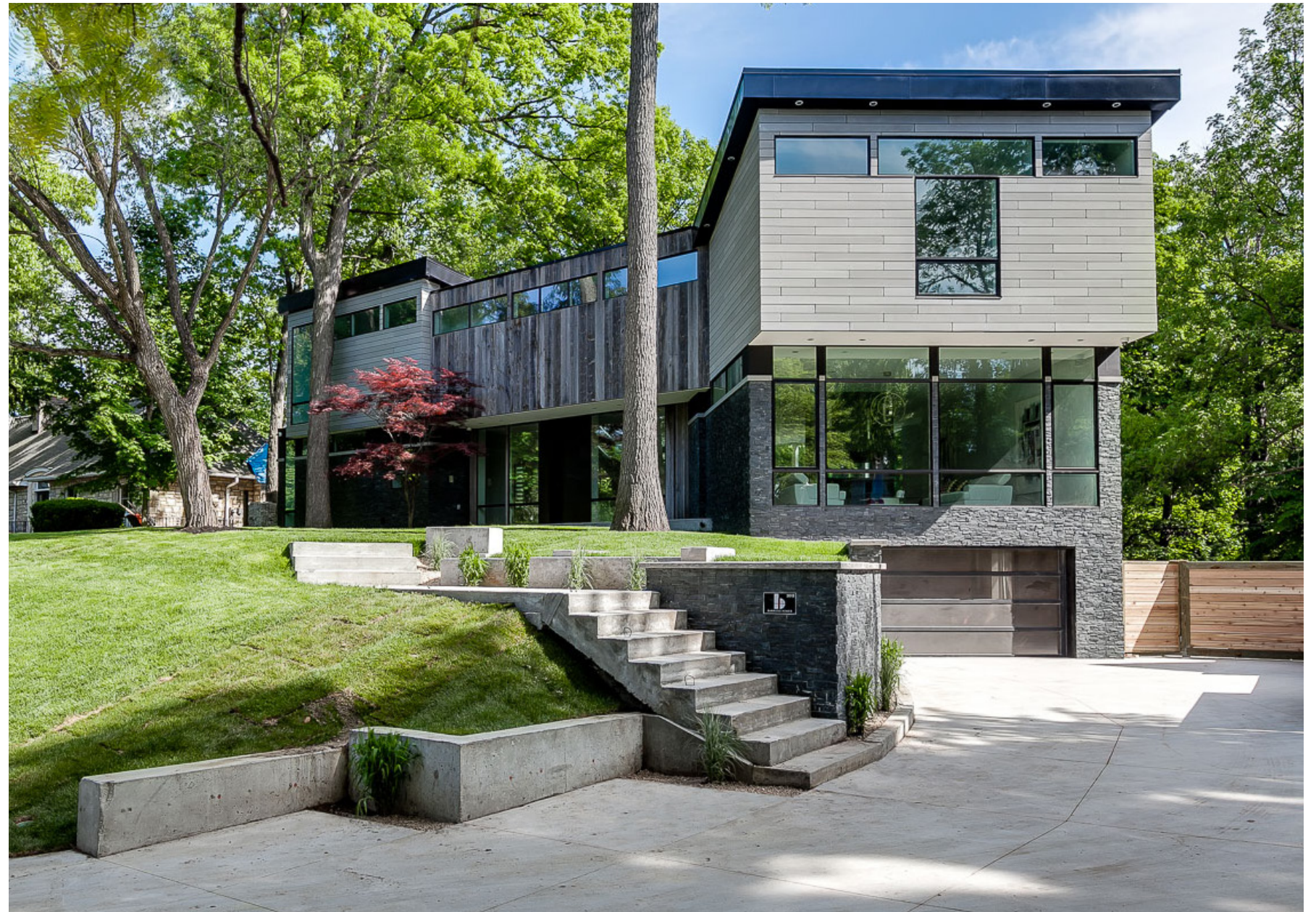
Hillside House, perched atop a hill, was inspired by the views and natural surroundings. The house feels as if it's floating within the trees.

Our clients generally have younger children, are tech savvy, and entertain often. For these clients, home automation was/is a perfect fit. They appreciate that they can check security cameras while they travel abroad, see who is visiting upon arrival, receive notifications as their children come and go, and—of course—it's a huge bonus to be able to fully control their music, lighting, and other features as they host events without ever leaving their guests' presence.