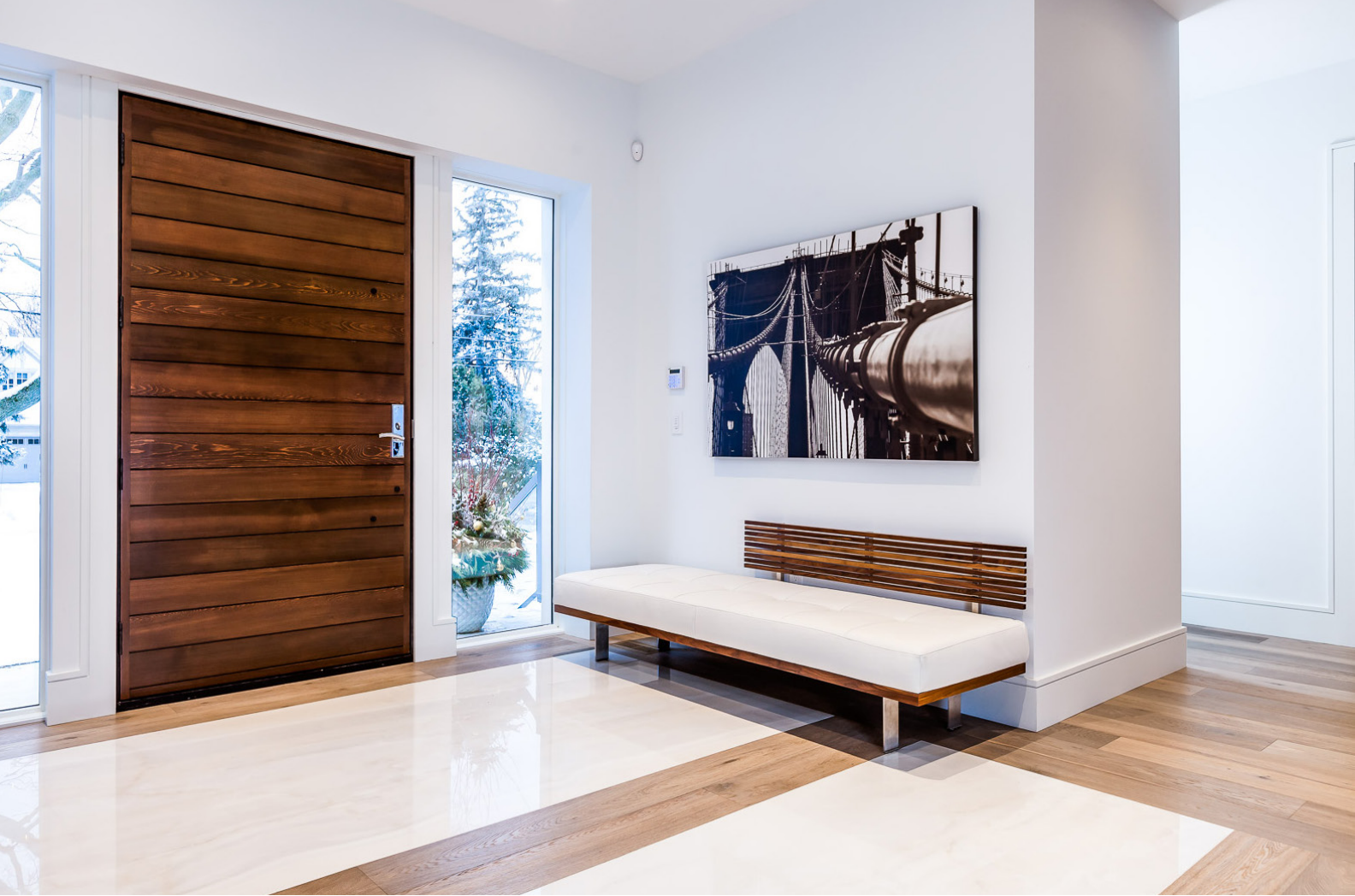
Luminoso is picture-perfect and is the epitome of modern design with super clean lines.